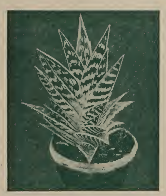
ALOE VARIEGATA A type picture of a large group of beautifully marked plants

Foreword: For canyon hillsides and larger plantings, nothing can exceed the larger Agaves and Aloes, the latter making a blaze of color when in bloom. There are Agaves and Aloes to suit every taste and every requirement. Sizes range in both classes from a tea-cup to a garage. Colors of blossoms range from pale yellow or green to orange and brilliant scarlet.